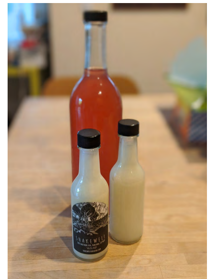
To-Go drinks and drink mixes at Shakedown in Oakland, CA

For restaurants relying on to-go orders, you can save money and prevent waste by only providing accessory or additional single-use disposables by request , or by training your staff to ask before including accessory disposables with orders (i.e., plastic utensils, straws, napkins, condiment packages, etc.).