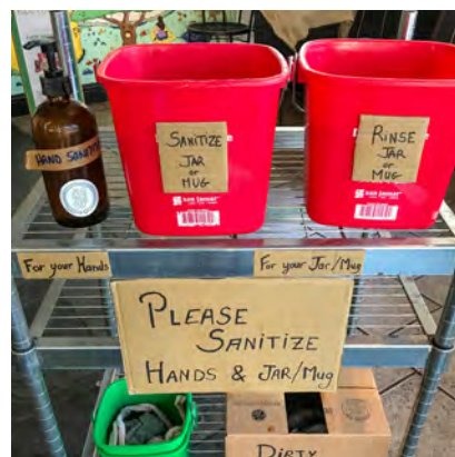
In-store sanitation stations for those cities which allow customers to sanitize their own jars

This system requires more logistics, however it keeps long-term costs down and helps create loyal regular (and returning) customers. Staff are protected from touching reusables until they have been professionally sanitized.