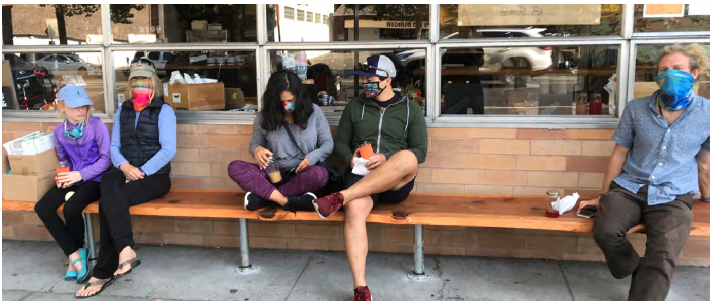
The “New Normal”: Outdoor, socially distanced seating with masks (and reusables!)

https://www.surfrider.org/coastal-blog/entry/how-to-reopen-restaurants-while-safely-using-reusables