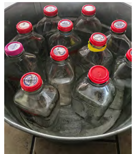
Straus Milk Jars ready for return (sanitized and returned to store for deposit) from MudLab.